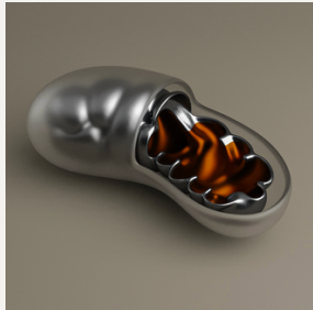
CALCIUM ALPHA- KETOGLUTARATE